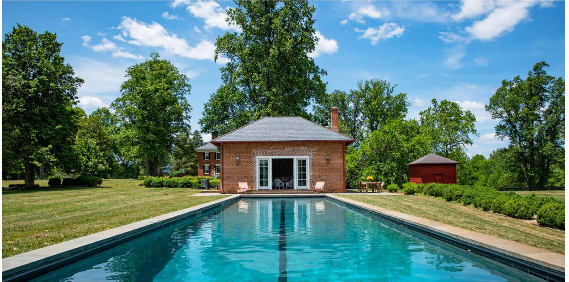
Heated, saltwater pool with automatic cover A wonderful place to relax and watch the clouds float by.