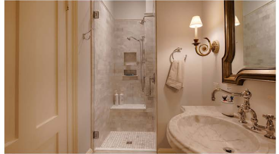
Two en suite bedrooms on the second floor. Both have a fireplace.