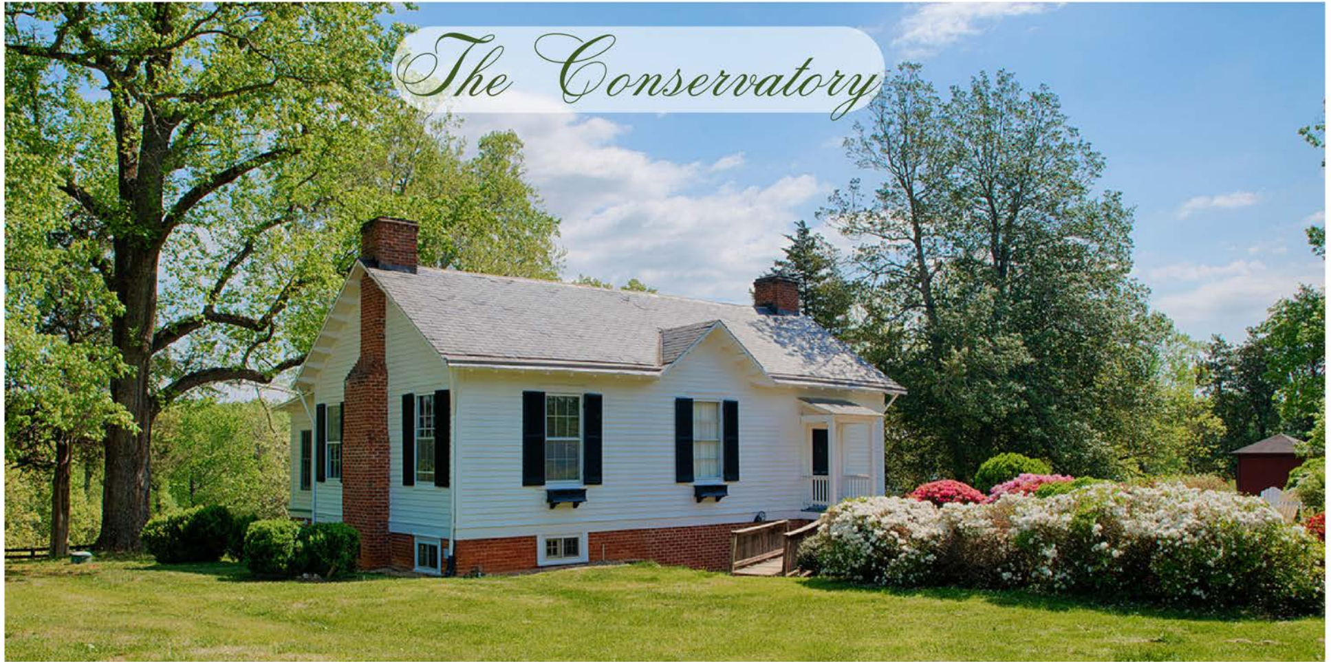
The Conservatory, adjacent to the manor home, makes a great office, guest cottage or Au Pair residence.