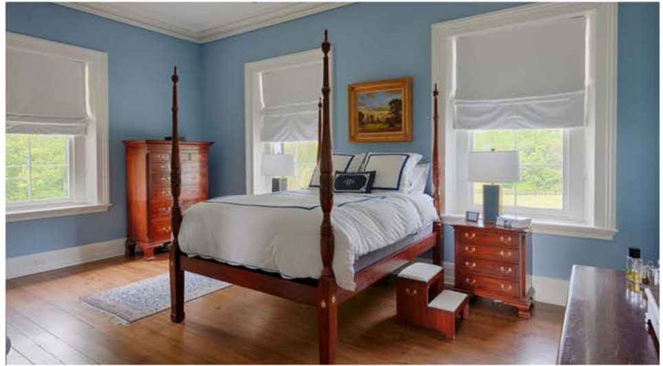
The light-filled owners' suite with fireplace, luxury bathroom with fireplace & walk-in closet. The hallway closet houses a stackable washer & dryer and laundry sink.