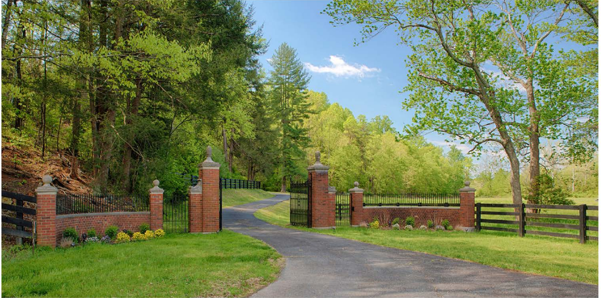
A Private & Secure Estate of 286 Acres in Keswick, Virginia